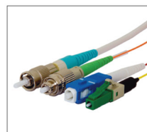
Available for Lynx-Custom Fit™ Splice-On Connector