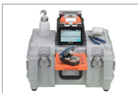
Carrying case with worktable CC-72