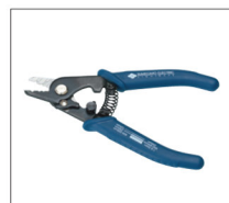
Jacket remover JR-M03