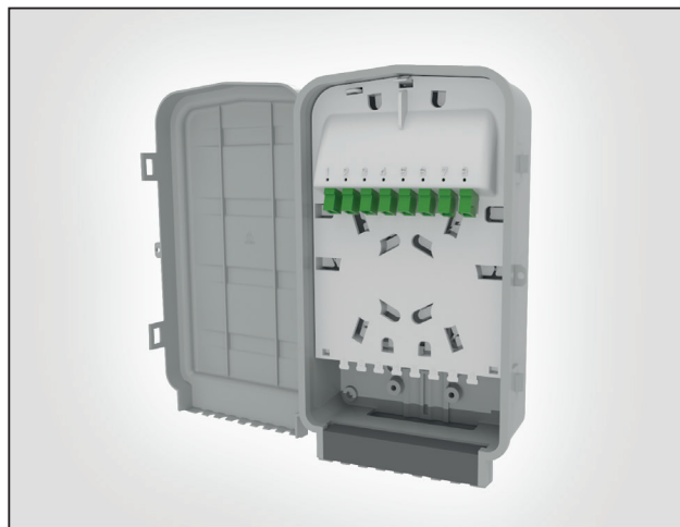
MDU - S1 with 8 LX SX connections.