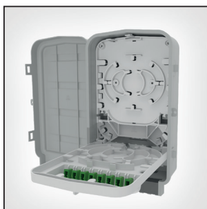
Fibre Splice Management Tray.