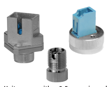
Unit comes with a 2.5mm universal input adapter. Additional adapters are available; see next page for a full list of adapters.