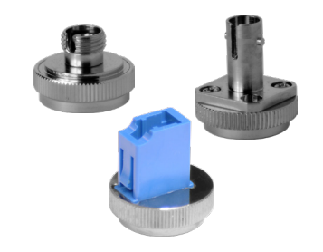
Quick-change adapters allow users to adjust the DLS 655 output to match their testing situation. See next page for full list of adapters.