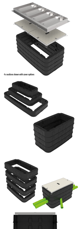
4 x sections shown with cover options