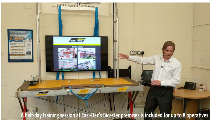
A half-day training session at Easi-Dec's Bicester premises is included for up to 8 operatives