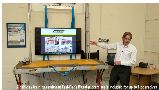
A half-day training session at Easi-Dec's Sicester premises is included for up to 8 operatives