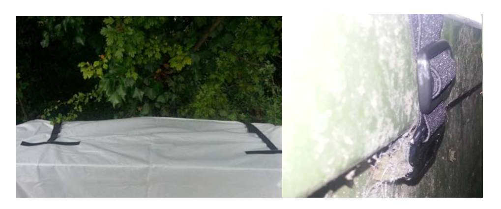
Fig 2 Fig 3

2. Place the cover over the PCP and use the retaining hooks to secure to the rear of the PCP. See Fig's 2 & 3