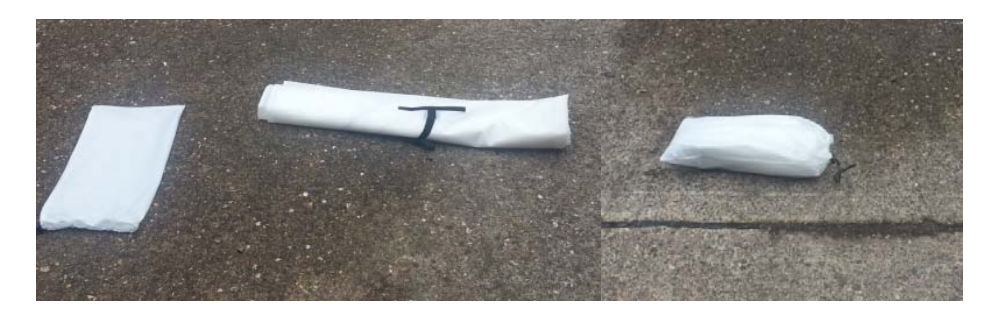
Fig 7 Fig 8

4. When removing the cover, release the clamps, remove the securing hooks at the rear and elastic cords on the door first then place flat on the floor folding into a rough square and pack in to the bag supplied. The bag is oversized to allow for easy fit. (Fig. 7 & 8)