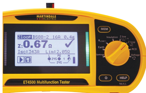
Pass/fail testing to the latest third amendment values