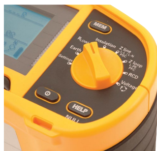
Easy selection of tests and on-screen help

The ET4000 and ET4500 multifunction testers simplify 18th edition testing by having the latest fuse tables for Zs values built-in together with red and green LED indicators for instant pass/fail confirmation.