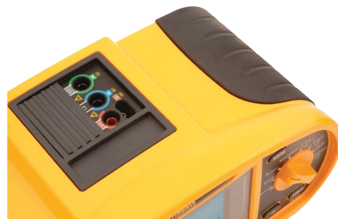
4mm sockets for standard Martindale lead sets. USB for downloading.